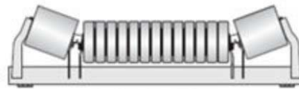
Troughed Belt Picking and Feeder Idler