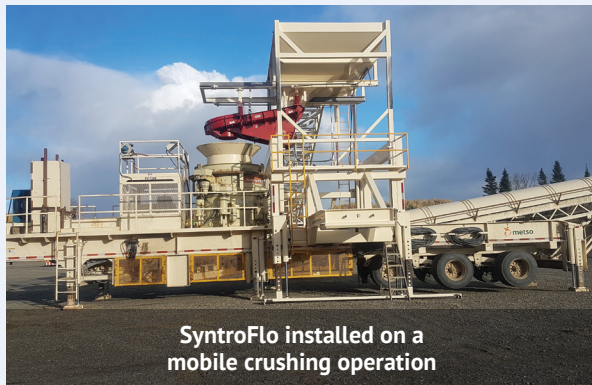
SyntroFlo installed on a mobile crushing operation

Adaptable to your crushing operation needs, whether mobile or stationary